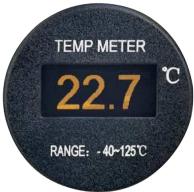
RJ45 UNIVERSAL Radio Remote Microphone Socket

Refer to AOBPO016 in "Power Socket -Round" -- Page 8