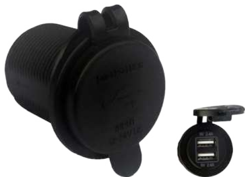
12V/24V Dual USB Charger

Refer to PO002 in "Power Socket -Round" -- Page 8