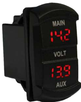
Dual VoltMeter in RED

SKU: PO6DVMR SPECIFICATIONS: Carling ARB rocker switch size Easy to install Indicator light color: RED Dimensions: approx.45(H)x24(W)x50mm(L) (including the size of pins) Color: Black