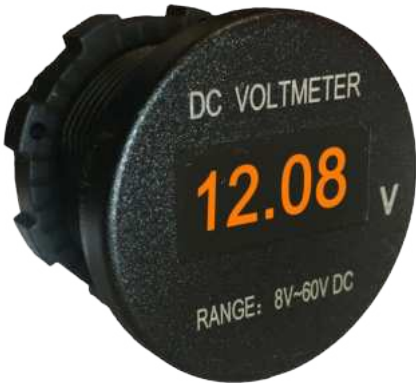
12/24V OLED Voltmeter AMBER

Refer to AOBPO013R in "Power Socket -Round" -- Page 9