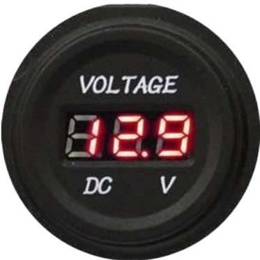
12V/24V Volt Meter LED Red

Refer to PO011B in "Power Socket -Round" -- Page 7