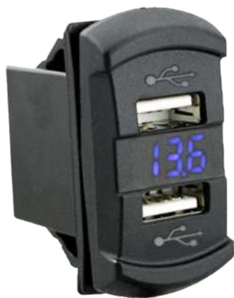
Dual USB Charger with Blue LED VoltMeter

Refer to PO002 in "Power Socket -Round" -- Page 8