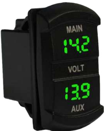
Dual VoltMeter in GREEN

SKU: PO6DVMB SPECIFICATIONS: Carling ARB rocker switch size Easy to install Indicator light color: BLUE Dimensions: approx.45(H)x24(W)x50mm(L) (including the size of pins) Color: Black