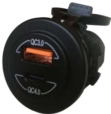
12-24V Power Socket Dual USB Charger QC3.0+TYPE C

Refer to PO022 in "Power Socket -Round" -- Page 7