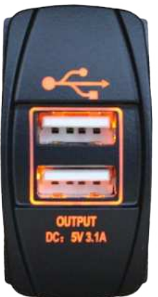
USB Charger 600s Rocker Switch Size in AMBER

SKU: PO6USBG SPECIFICATIONS: USB Front Size: 48.5mm x 24.5mm Socket Size: 36mm x 21mm Depth: 36mm Housing: Black Light: LED GREEN Input DC: 12V ~ 24V Output: 5V 3.1A combined (1.0A for one port and 2.1A for the other port) Mounting: Flush by pushing the Dual USB Charger into the carling rocker type socket