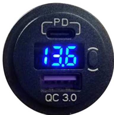
12-24V 3 IN 1 Port Socket USB Charger QC3.0 + PD TYPE + Volt Meter

Refer to PO018 in "Power Socket -Round" -- Page 9