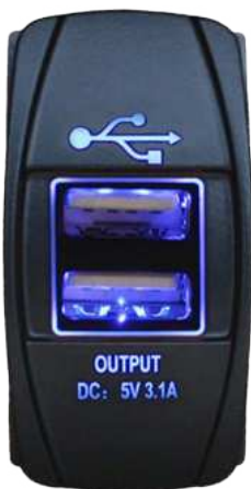
USB Charger 600s Rocker Switch Size in Blue

Refer to PO022 in "Power Socket -Round" -- Page 7