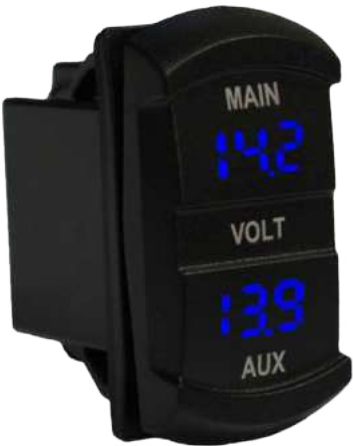
Dual VoltMeter in BLUE

Refer to AOBPO014 in "Power Socket -Round" -- Page 8