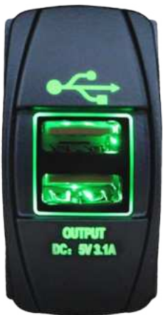
USB Charger 600s Rocker Switch Size in Green

SKU: PO6USBB SPECIFICATIONS: USB Front Size: 48.5mm x 24.5mm Socket Size: 36mm x 21mm Depth: 36mm Housing: Black Light: LED BLUE Input DC: 12V ~ 24V Output: 5V 3.1A combined (1.0A for one port and 2.1A for the other port) Mounting: Flush by pushing the Dual USB Charger into the carling rocker type socket