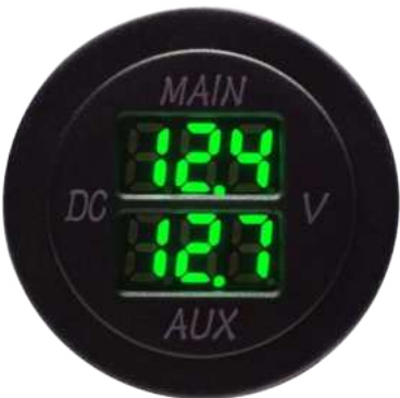
12/24V AUX LED Dual Voltmeter GREEN

Refer to AOBPO013B in "Power Socket -Round" -- Page 9