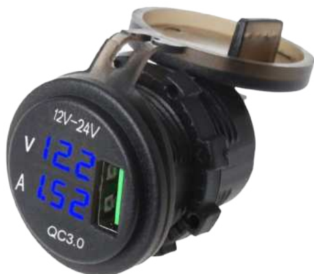
12-24V 3-in-1 Power Socket with LED light in Blue

Refer to PO019 in "Power Socket -Round" -- Page 7