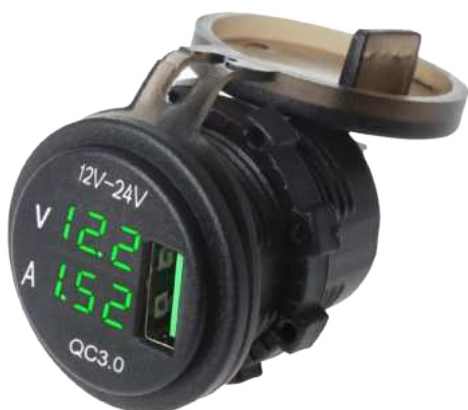
12-24V 3-in-1 Power Socket with LED light in Green

Refer to PO023B in "Current Meter" -- Page 3