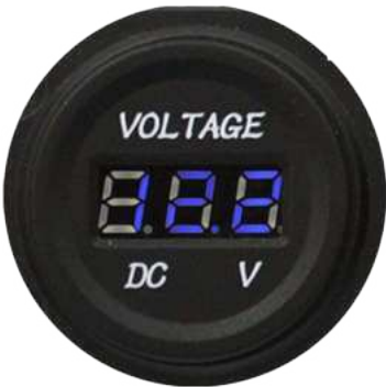
12V/24V Volt Meter LED Blue

Refer to PO011B in "Power Socket -Round" -- Page 7