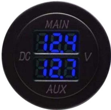
12/24V AUX LED Dual Voltmeter BLUE

Refer to PO011R in "Power Socket -Round" -- Page 8