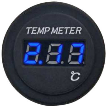
12V Mini LED Temp Meter BLUE

Refer to AOBPO016 in "Power Socket -Round" -- Page 8