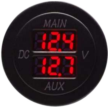
12/24V AUX LED Dual Voltmeter RED

Refer to AOBPO013R in "Power Socket -Round" -- Page 9