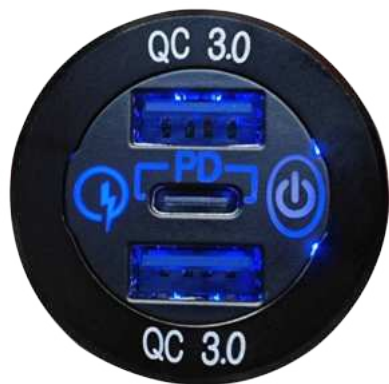
12-24V 3-Port Socket Dual USB Charger QC3.0 + PD TYPE

Refer to PO018 in "Power Socket -Round" -- Page 9