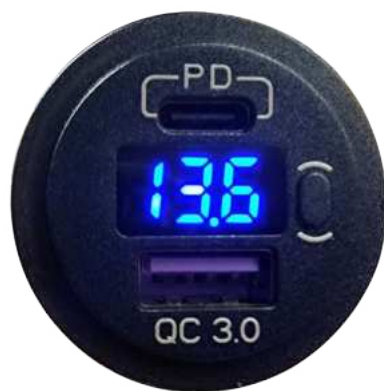
12-24V 3 IN 1 Port Socket USB Charger QC3.0 + PD TYPE + Volt Meter

SKU: PO6DVMR SPECIFICATIONS: Carling ARB rocker switch size Easy to install Indicator light color: RED Dimensions: approx.45(H)x24(W)x50mm(L) (including the size of pins) Color: Black